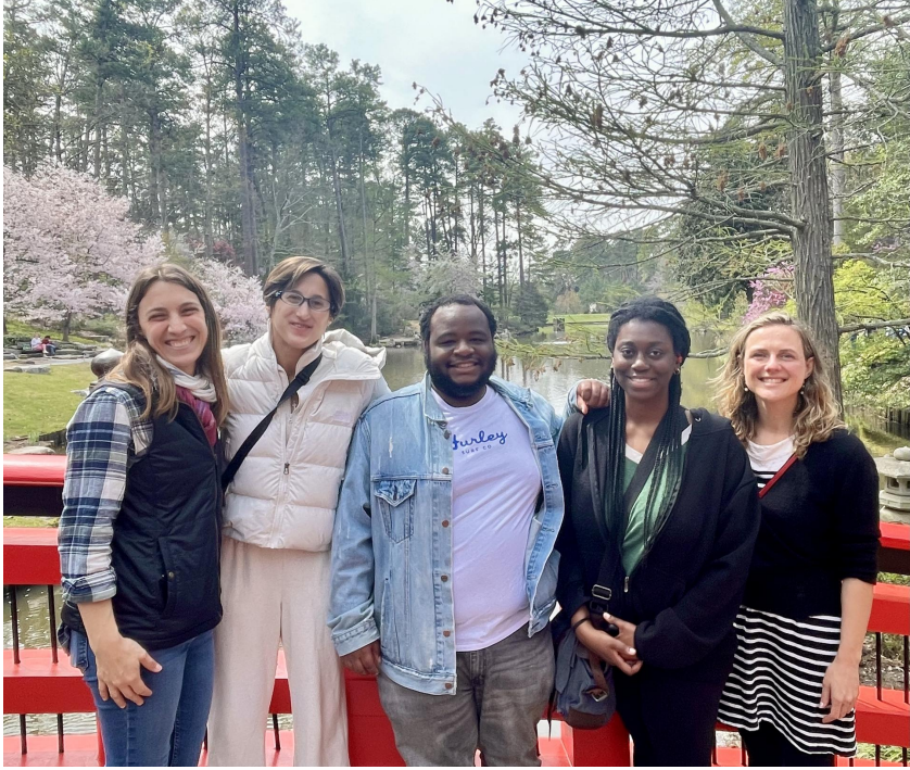
Cherry tree blossoms at Duke Gardens!