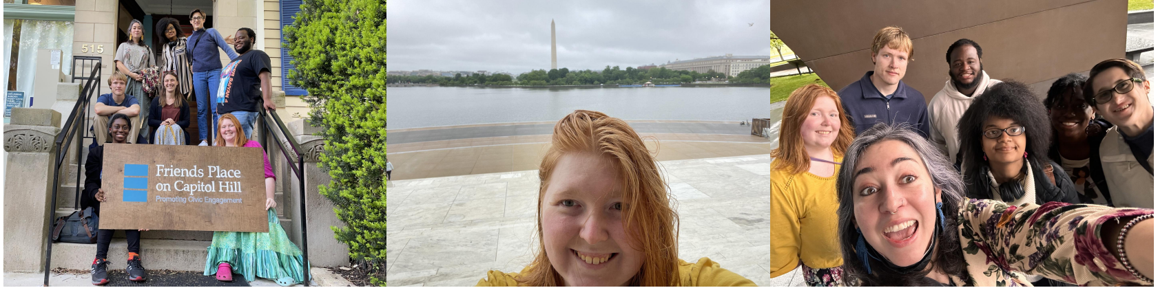
Some photos from our DC Retreat!