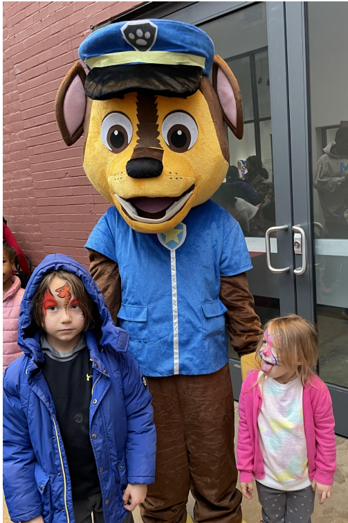
Which fellow is behind the mask? Serving at Book Harvest's Dream Big event