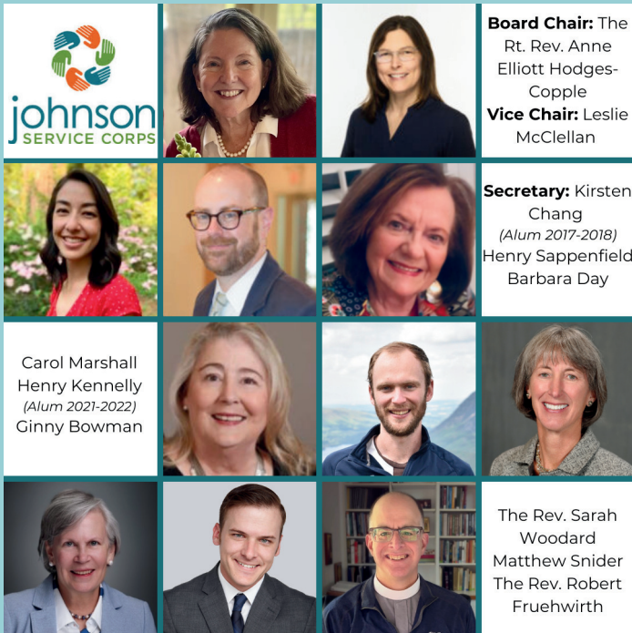
Our 2024-2025 Board of Directors, sworn in July 2024